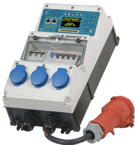
Energy counting: 1 energy meter 3x230V, 10 (65) A, official MID